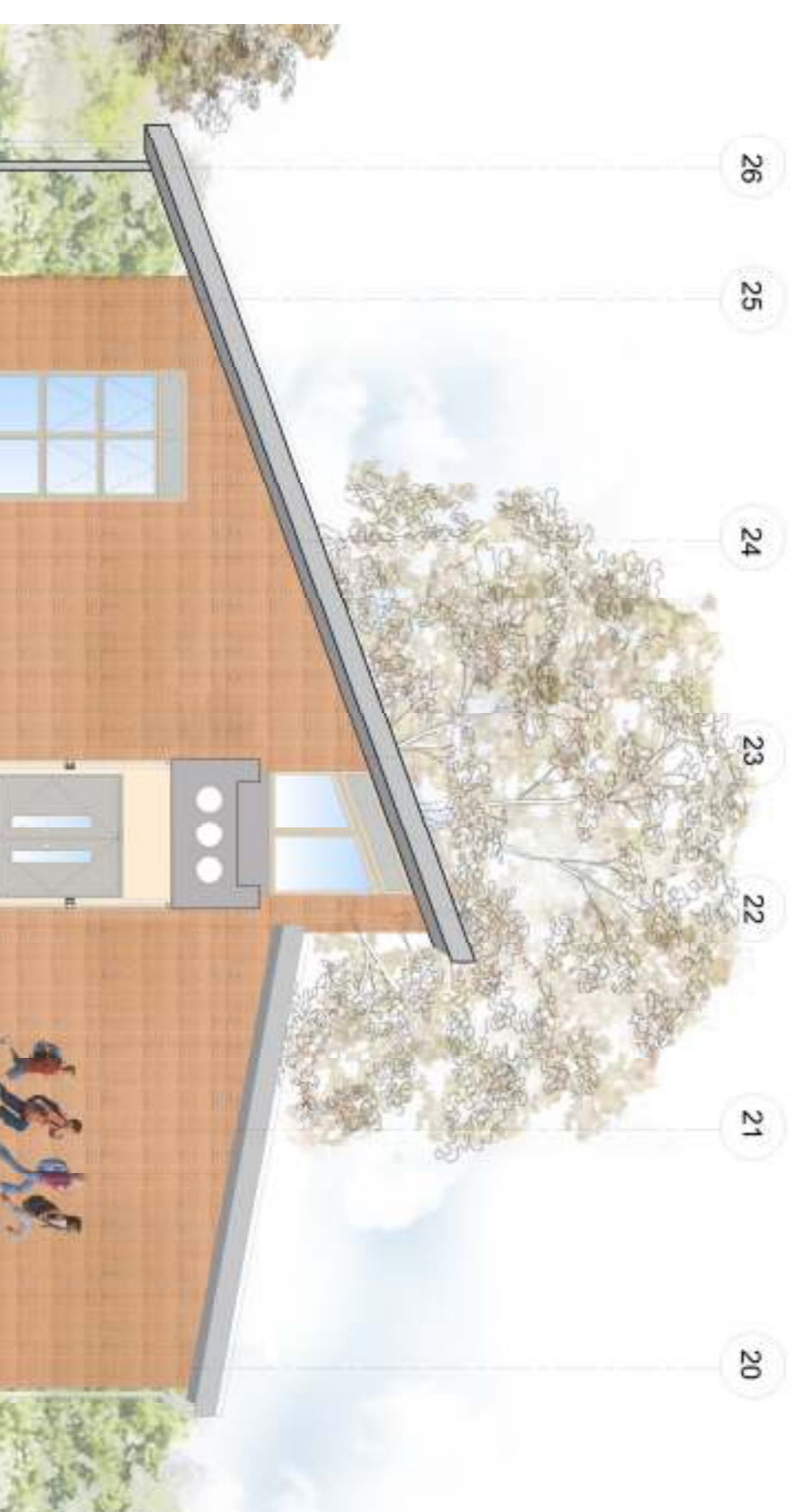
North Block Elevation D 1:100

P3 - Planning Application - KM (11.08.17)