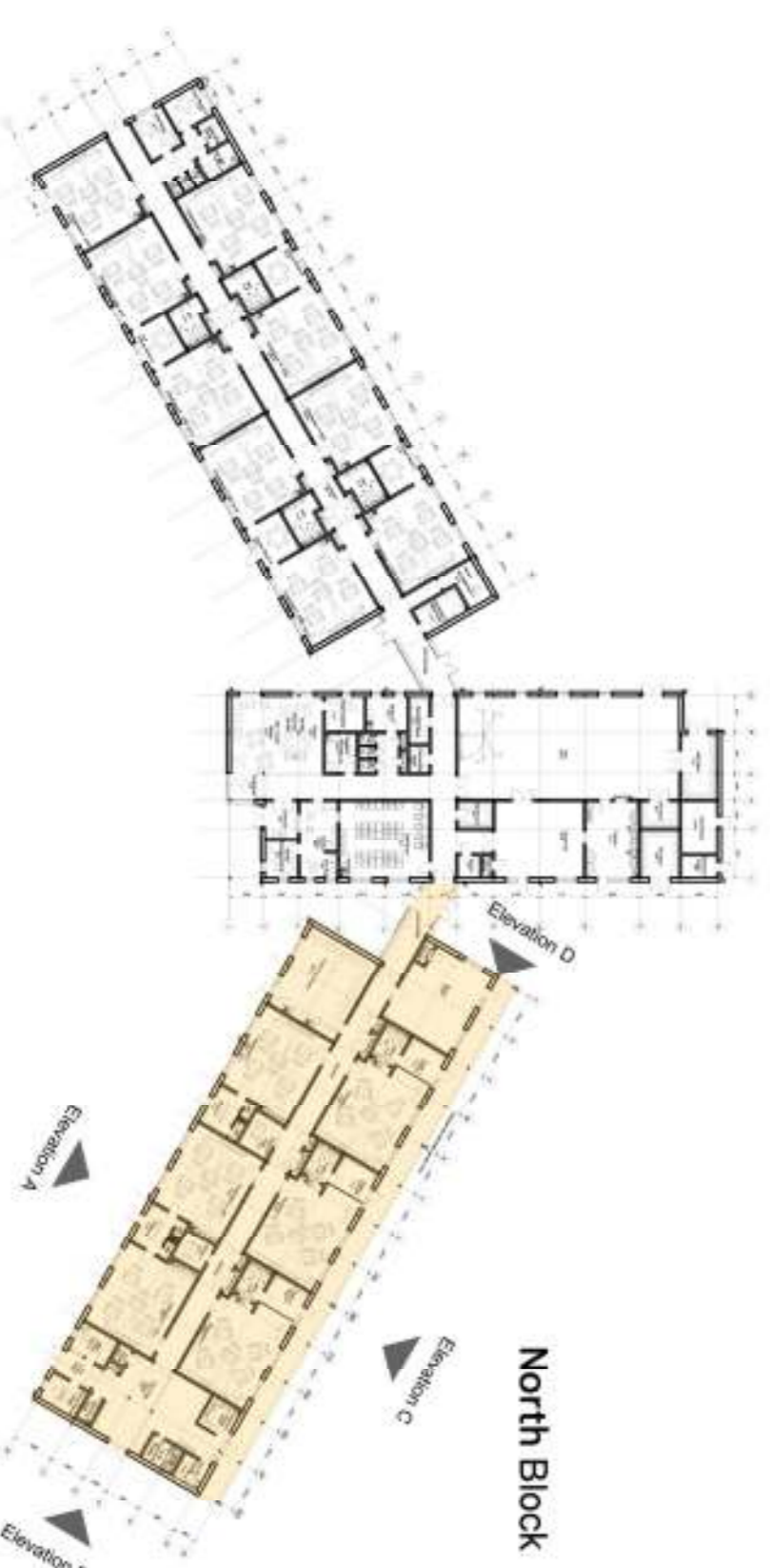
Key Plan 1:500