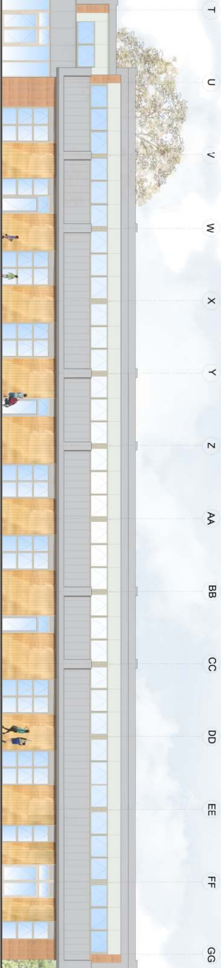
North Block Elevation A 1:100

© Dorset County Council. LA 100019790. 2017.